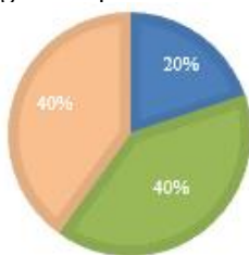
2021 Target Compensation Mix (CEO)